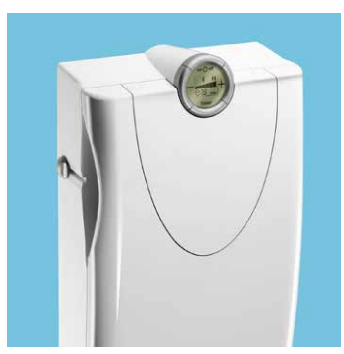
Wall-Mounted Ventilator with Sound Absorption

AeroPac® provides a solution that is already well-proven in numerous large construction projects. The AeroPac® ventilator takes in outside air, removes engine emissions, absorbs airborne noise and silently provides a healthy supply of clean, fresh air.